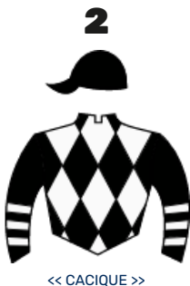
<< CACIQUE >>

2064 General: 1° 2° 3° 4° NT CC Esta Písta: 1° 2° 3° 4° NT CC REG-BARR-PES 1° 2° 3° 4° NT CC S.Ganadas