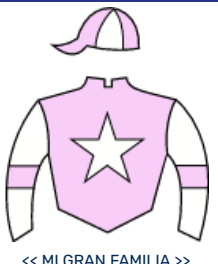
<< MI GRAN FAMILIA >>

Equal Stripes y Forty Marchanta por Roar ( Haras Argentina )