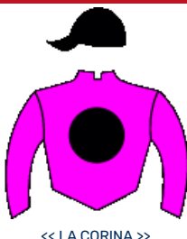
<< LA CORINA >>

1 MAXIWARIO 4 16 13 11 55 99 3 9 4 4 25 45 1 6 2 0 6 15 $19.224.500