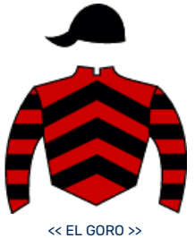
<< EL GORO >>

Sonoma Band y Proud Fatima por Pure Prize ( Haras Torche Y Lanza Ltda. )