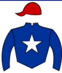
<< TONO >>

3 PESCADORA DE PERLA 1 0 1 0 1 3 1 0 1 0 1 3 0 0 0 0 0 0 $5.760.000