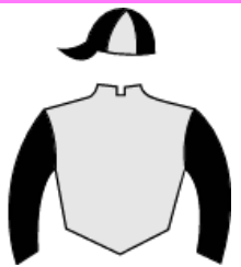
<< CAROLINA PIA >>

California Chrome y Palabras Alegres por Gstaad II (Haras Santa Olga)