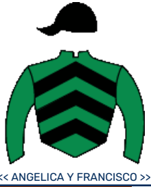
<< ANGELICA Y FRANCISCO >>

LA INSTRUMENTISTA 1 2 4 7 28 42 1 2 4 7 26 40 0 0 1 0 3 4 $3,673.250