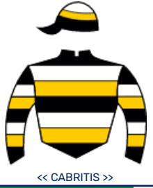
<< CABRITIS >>