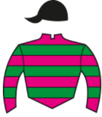
<< MARETE >>