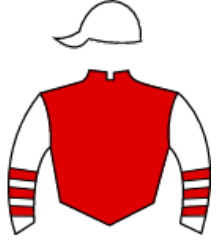
<< LEON POBLETE >>

MI VIEJA LINDA (ARG) 3 6 6 4 39 58 3 6 6 3 35 53 2 0 0 0 6 8 $15.339.000