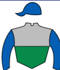
<< MONSEÑOR >>

El Huene y Cossi Fan Tutte por Pavarotti II (Haras Santa Loreto)