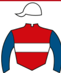
<< LOS GRITONES >>

Viscount Nelson y Eres Magica por Stuka II ( Haras Don Alberto )