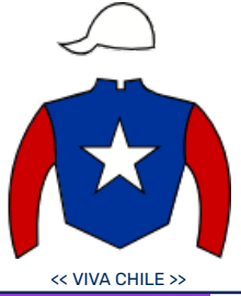
<< VIVA CHILE >>

Patternrecognition y Fonte Aretusa por Edgy Diplomat (Haras Santa Olga)