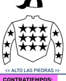
<< ALTO LAS PIEDRAS >>

(M.M.) 5 50,0 8 J.Pimentel (7) 12 C. Sepulveda B. Ascot Prince y Wickham por Powerscourt ( Haras Don Luis )