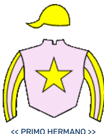
<< PRIMO HERMANO >>

2 GEORGE BLACK 4 8 3 3 23 41 2 1 2 2 12 19 0 1 0 0 1 2 $7.027.000