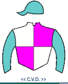
<< C.V.D. >>