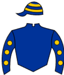
<< KISSIMMEE >>

4 CAFE RISTRETTO 8 11 7 9 22 57 8 11 7 9 21 56 3 2 0 1 1 7 $51.478.000