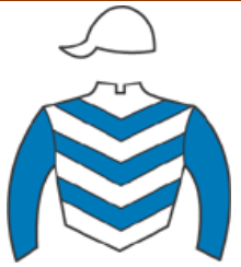
<< GAONA HERMANOS >>

LOMBARDY 3 18 10 15 57 103 3 15 10 14 55 97 0 2 2 1 10 15 $32.109.500