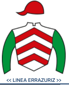
<< LINEA ERRAZURIZ >>

Indian Trail y A La Ronda Ronda por Malek (Haras Arsenio Ruiz N.)