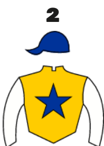
<< DE QUIVAS >>

2054 General: 1° 2° 3° 4° NT CC Esta Pista: 1° 2° 3° 4° NT CC REG-BARR-PES 1° 2° 3° 4° NT CC S.Ganadas