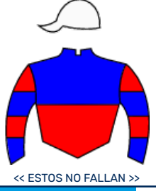
<< ESTOS NO FALLAN >>

California Chrome y Sea Of Love por Denver County (Haras Sumaya)