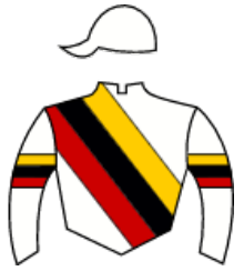
<< TATA PEPE >>

Seeking The Dia y Shes So Cold por Roman Ruler (Haras Santa Monica)