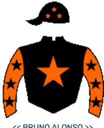
<< BRUNO ALONSO >>

1 KYOMI 3 4 2 4 23 36 3 4 2 4 23 36 2 1 0 2 7 12 $14.565.500