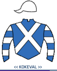
<< KOKEVAL >>

I FEEL FINE 13 18 20 16 157 224 9 11 11 115 157 1 5 3 1 14 24 $22,106.500