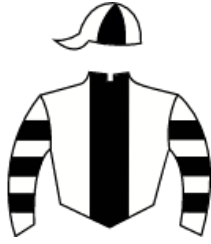
<< SIEMPRE AMIGOS >>

Dylan Thomas y Crystal City por Dushyantor (Haras Don Alberto)