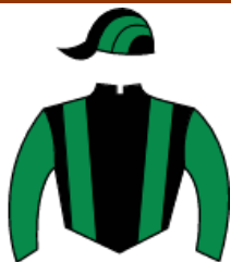
<< CIRUELILLO >>

The Lumber Guy y Veta Este por Heavyweight Champ (Haras Dadinco)