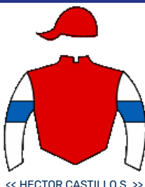
<< HECTOR CASTILLO S. >>

3 SAHARA PRINCESS 3 3 2 2 20 30 3 3 2 2 20 30 0 0 0 1 2 3 $10.331.500