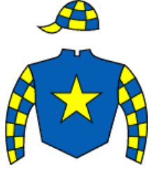
<< GRAN XIME >>

VIDA SABROSA 5 0 2 3 22 32 5 0 2 3 22 32 0 0 0 0 3 3 $12.091.500