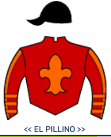
<< EL PILLINO >>

Katmai y Pleasant Fever por Pleasant Tap (Haras Agric.Taomina Ltda.)