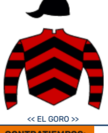
<< EL GORO >>

(M.A.) 3 52,0 7 N.Figueroa (9) 14 R. Quiroz S. Lemon Sour y Urucubaca por Peintre Celebre ( Haras Habib Al Medina )