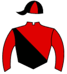
<< ORTEPAL >>

NUBES NEGRAS (ARG) 8 5 7 4 61 85 8 5 7 4 60 84 2 0 0 1 8 11 $24.768.500