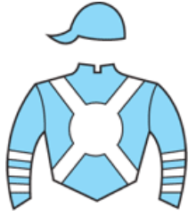
<< MAMEZA >>

LUCIA DE SIRACUSA 1 5 5 6 14 31 1 5 5 6 14 31 0 1 0 3 2 6 $8.948.500