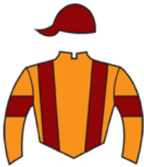
<< LAS ESTELAS >>

Passion For Gold y Bella Dominga por Tumblebrutus (Haras No Registrado)