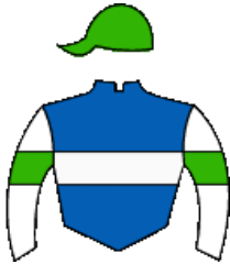
<< LA FLO >>

Fortify y Stormy Soberly por Bernstein (Haras Argentina)