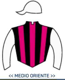
<< MEDIO ORIENTE >>

The Lumber Guy y Nadid por Happy Hunting (Haras No Registrado)