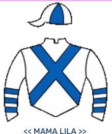
<< MAMA LILA >>