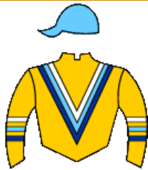
<< HERMANOS Y AMIGOS >>

(M.C.) 5 55,0 13 R.Dores (6) 10 C. Meneses S. Flyer y Reimportada por Harlans Holiday (Haras Viejo Perro)