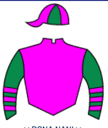
<< DONA NANI >>