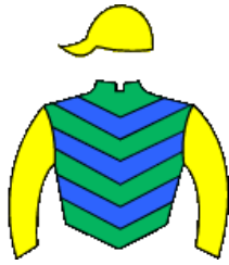
<< MISACRISEI >>

California Chrome y Irish Crown por Dunkirk (Haras Sumaya)