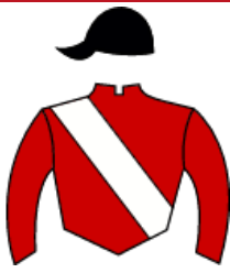
<< JULITA >>

1 AMAR AZUL 1 0 0 0 2 3 0 0 0 0 2 2 0 0 0 0 0 0 $7.000.000