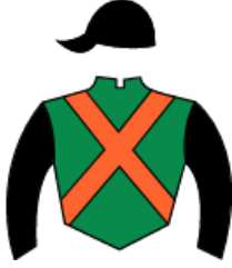
<< MARTINITA >>

Scat Royal y Heartrudis por Peintre Celebre (Haras Las Camelias)