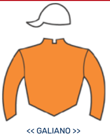
<< GALIANO >>