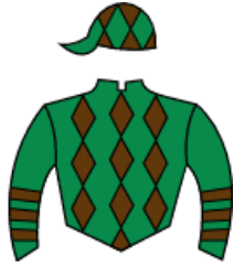
<< NATIVO >>

Ryduilluc y Polifema por Lookin At Blucky (Haras San Patricio)