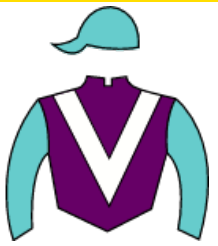
<< LOST VERA >>

Hootennany (Usa) y Hungry Eyes por Monthir ( Haras Santa Monica )