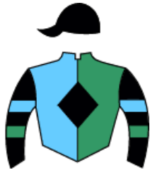
<< DON QUIJOTE >>

Midshipman y Stafeliz por Stuka II (Haras Don Alberto)