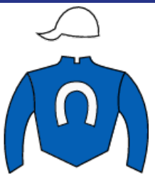
<< LUMARQ >>

Gemologist y Green Power por Dublin II ( Haras Sumaya )