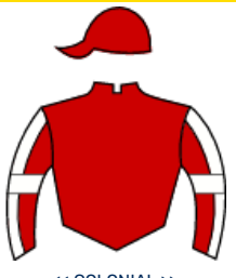
<< COLONIAL >>