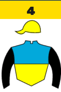
<< FILPO >>

2064 General: 1° 2° 3° 4° NT CC Esta Písta: 1° 2° 3° 4° NT CC REG-BARR-PES 1° 2° 3° 4° NT CC S.Ganadas