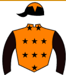
<< SIETE ESTRELLAS >>

Gemologist y Estilozza por Fusaichi Pegasus (Haras Sumaya)