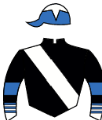
<< FERFON >>

Daddy Long Legs y Cata Luna por Fils Unique (Haras No Registrado)