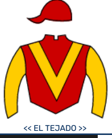
<< EL TEJADO >>

Hinz y Laguna Clara por Fusaichi Pegasus (Haras Bucarest)