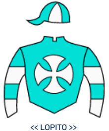
<< LOPITO >>