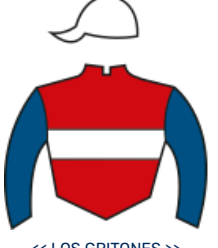
<< LOS GRITONES >>