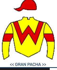
<< GRAN PACHA >>