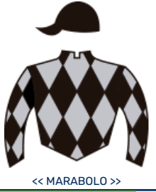
<< MARABOLO >>

GEORGINO 7 9 5 3 69 93 7 9 5 3 68 92 1 1 2 2 9 15 $25,605.500