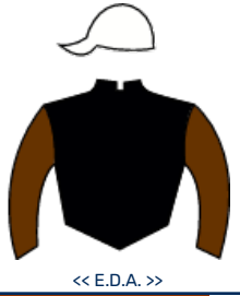
<< E.D.A. >>

The Lumber Guy y Entaquillada por Bouthan (Haras Lizzie)