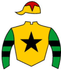
<< PIMPOLLO HERMOSO >>

Strong Mandate y Championshipseason por Bernardini (Haras Dona Icha)