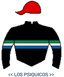
<< LOS PSIQUICOS >>

Ocean Terrace y Amarula por Columbus Day ( Haras El Sheik )