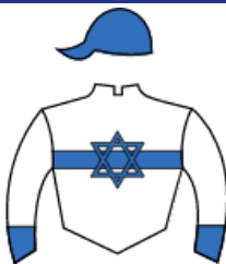
<< DEL ANDES >>

3 PAPITO RAMON 10 5 3 6 16 40 8 4 1 5 10 28 0 0 0 3 1 4 $37.218.000