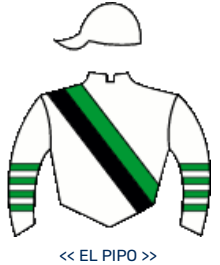
<< EL PIPO >>