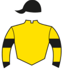
<< THAT >>