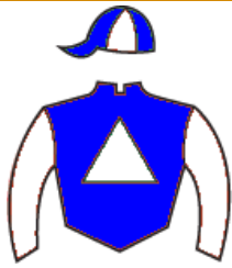
<< TIERRAS NEGRAS >>

Passion For Gold y Sunset Beach por Ministers Bid (Haras No Registrado)