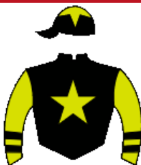
<< JAIME ESPINEIRA C. >>

1 KINO 16 13 6 4 25 64 15 13 4 4 21 57 1 2 0 1 6 10 $74.159.500