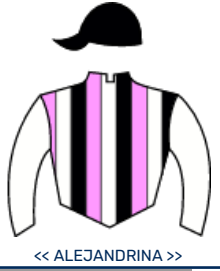
<< ALEJANDRINA >>

LA ROMPECORAZON 1 0 1 1 10 13 0 0 0 1 3 4 0 0 0 0 0 0 $5,244.000