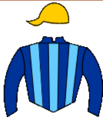
<< PER SEMPRE >>

Zawraq (Ire) y Autoritaria por Authorized (Haras San Ignacio)