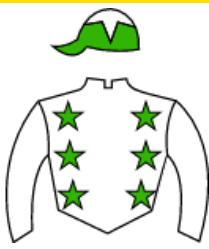
<< CARNES OLY >>

4 AMADA OLY 1 0 0 1 2 4 1 0 0 1 2 4 0 0 0 1 0 1 $7.445.250