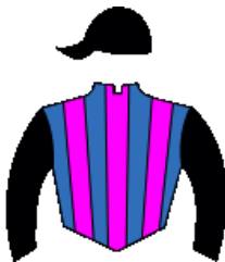
<< DANNY >>

2 MI PRIMO JUANJO 7 8 4 3 3 25 7 8 3 3 3 24 1 2 0 0 1 4 $50.913.000