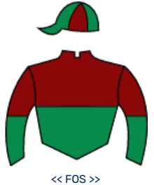
<< FOS >>