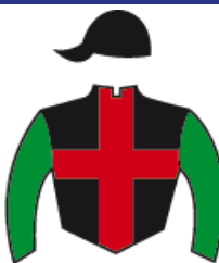
<< ELEPHANT >>

Grand Daddy y Tiferet por Tumblebrutus ( Haras Carioca )