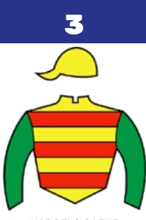
<< MARCELO SAENZ >>

2064 General: 1° 2° 3° 4° NT CC Esta Písta: 1° 2° 3° 4° NT CC REG-BARR-PES 1° 2° 3° 4° NT CC S.Ganadas