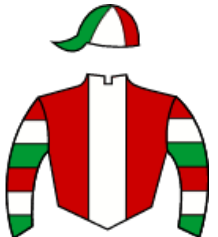
<< COLORADO VEINTITRES >>

Grand Daddy y Gaga Gulch por Thunder Gulch ( Haras Mocito Guapo )