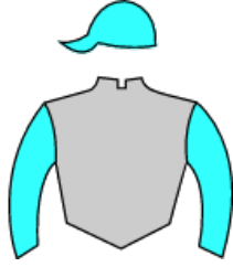
<< DON SANTIAGO >>