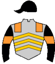
<< MARGAL >>

Mr Speaker y Villa Cana por Fusaichi Pegasus (Haras Cordillera)