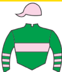
<< EL TIROL >>