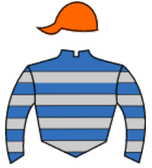
<< JAIMITO >>

Grand Daddy y Tropillera por Tumblebrutus ( Haras Mocito Guapo )