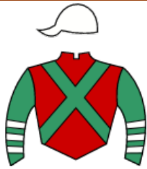
<< GRAN GALLITO >>