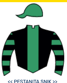
<< PESTANITA SNIK >>