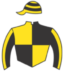
<< OLY NANY >>

Gemologist y Cancion De Guerra por War Chant (Haras La Compania)