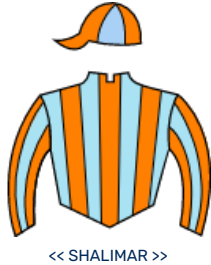
<< SHALIMAR >>

Iron Clad y Delisha por A.P.Five Hundred (Haras El Refugio)