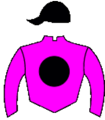
<< LA CORINA >>

Seeking The Dia y Rock Cristal por Rock Of Gibraltar (Haras Don Alberto)