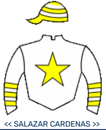
<< SALAZAR CARDENAS >>

HUNDRED KISSES 7 10 11 9 85 122 0 1 0 0 30 31 0 0 1 0 9 10 $7.483.750