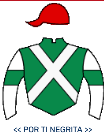
<< POR TI NEGRITA >>