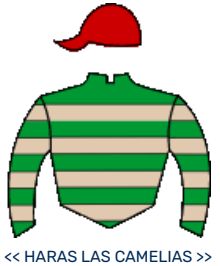
<< HARAS LAS CAMELIAS >>

Scat Royal y Showcase por Tumblebrutus (Haras Las Camelias)