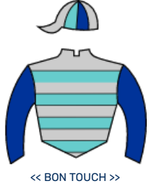
<< BON TOUCH >>

ROSARIO TIJERA 6 7 5 8 61 87 2 1 1 2 44 50 0 0 0 1 11 12 $5.775.000