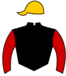
<< LOS PATOS >>