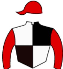
<< LINDA FAMILIA >>

Gran Villano y Sponza por Squire Jones (Haras Longavi)