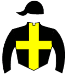
<< BORIL BENITO CH. >>

Until Sundown y Feudale por Slew Gin Fizz (Haras Habib Al Medina)