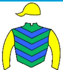
<< MISACRISEI >>

California Chrome y Irish Crown por Dunkirk (Haras Sumaya)