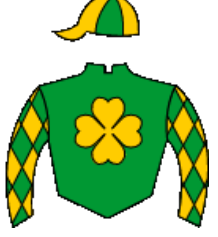
<< LOR KEDIMAR >>

SALUD COMPADRE 4 3 2 4 43 56 4 3 2 4 42 55 0 0 0 0 9 9 $10.746.500