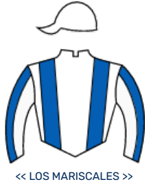
<< LOS MARISCALES >>

Dangerous Midge y Ojos Guapos por Tanaasa (Haras Porta Pia)