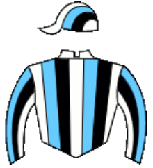
<< MANOJITOS >>

Migliore Di Tutti y Danke Mama por Dance Brightly ( Haras Il Campione Spa )