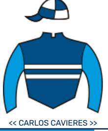
<< CARLOS CAVIERES >>

SE NOS VA LA VIDA 1 2 2 5 13 23 0 1 0 1 6 8 0 0 0 0 1 1 $5.380.500