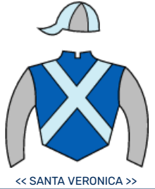
<< SANTA VERONICA >>

Grand Daddy y Stach por State Of Play (Haras Mocito Guapo)