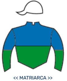
<< MATRIARCA >>

Imperia II y Cristina Ka por Indy Dancer (Haras Matriarca)