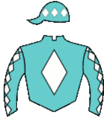
<< LOS COMPADRES >>

MI DIEZ POR CIENTO 7 3 5 3 55 73 7 3 5 3 54 72 1 0 0 0 1 9 11 $19.700.500