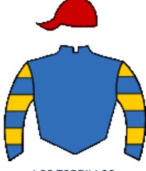
<< LOS TORDILLOS >>