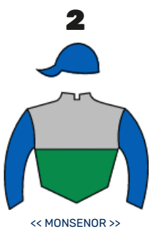
<< MONSEÑOR >>

393 General: 1° 2° 3° 4° NT CC Esta Písta: 1° 2° 3° 4° NT CC REG-BARR-PES 1° 2° 3° 4° NT CC S.Ganadas