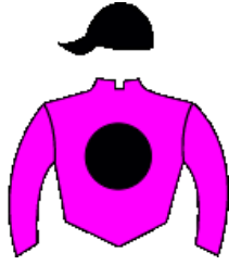
<< LA CORINA >>