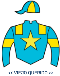
<< VIEJO QUERIDO >>

(M.C.) 4 56,0 10 F.Moreno 4 J. Lastra B. Bad Daddy y La Blusa Azul por Last Best Place ( Haras Santa Isabel )