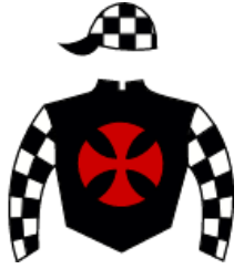
<< GARAGE JCS >>