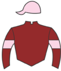
<< SANTA ANA >>

Van Nistelrooy y Cappadora por Medaglia Doro (Haras Dadinco)