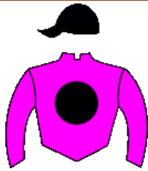
<< LA CORINA >>