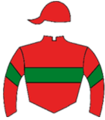
<< HARAS SUMAYA >>