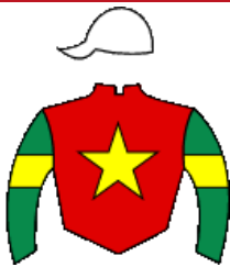
<< EL WAINA >>