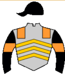
<< MARGAL >>