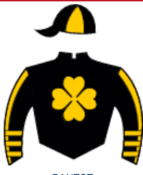
<< PANTOT >>