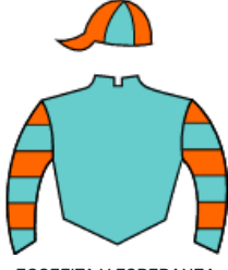
<< JOSEFITA Y ESPERANZA >>