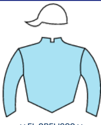
<< EL OBELISCO >>