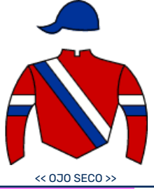
<< OJO SECO >>

MIND THE GAP 2 2 2 2 18 26 0 2 1 1 10 14 0 0 0 0 2 2 $2.992.500