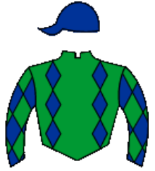
<< CARVATERO >>

Stay Thirsty y Chantajera por Stuka II ( Haras Don Alberto )