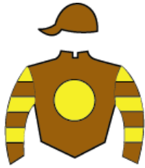
<< LUCARASTE >>

LA NORTINA 5 4 6 3 44 62 5 4 6 3 44 62 0 0 0 0 8 8 $16.270.000