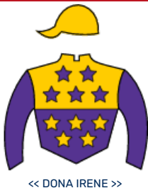
<< DONA IRENE >>

1 MAIDA CONTENTA (ARG) 0 0 0 4 5 1 0 0 0 4 5 0 0 0 0 2 2 $4.100.000