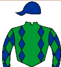
<< CARVATERO >>

Daddy Long Legs y Puro Diabla por Awesome Patriot (Haras Santa Sara)