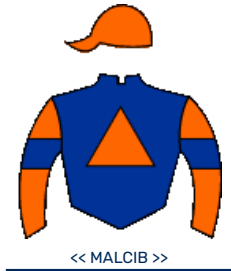
<< MALCIB >>

Point Of Entry y Kleeve Edge por Scat Daddy (Haras Rio Grande)