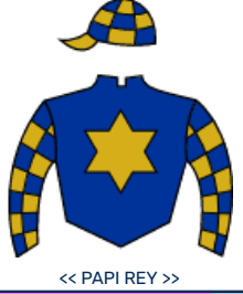
<< PAPI REY >>

JOHN WAYNE 34 25 23 17 193 292 12 8 8 3 86 117 4 4 2 0 16 26 $64.931.500