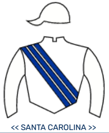
<< SANTA CAROLINA >>

ATENTOS SALUDOS 1 0 3 1 11 16 1 0 3 1 11 16 0 0 1 0 3 4 $5.652.500