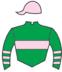
<< EL TIROL >>

SUFFISANO 6 5 6 6 47 70 5 5 6 6 44 66 2 0 0 0 1 4 7 $21.264.000