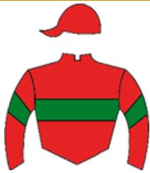
<< HARAS SUMAYA >>