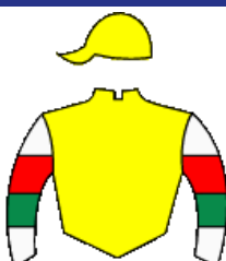
<< KAROLO >>

Ivan Denisovich y Katuska II por Dalakhani (Haras Don Alberto)