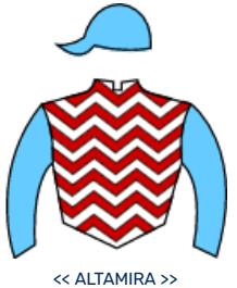
<< ALTAMIRA >>

1 LLUVIA DE GRACIA 4 1 5 3 34 47 4 0 5 3 29 41 0 1 0 1 2 4 $10.565.000