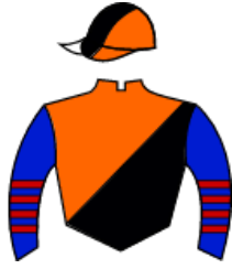
<< NUESTROS DESEOS >>

Gstaad II y LuXuria por Sir Cat (Haras Dadinco)