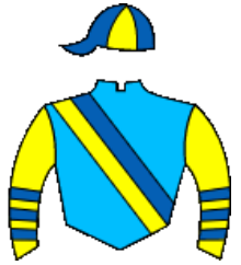
<< DEJENME SONAR >>

Gemologist y Indy Tiberina por Indy Dancer ( Haras San Ignacio )