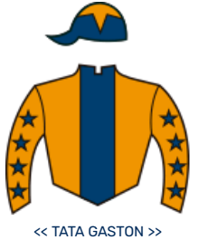
<< TATA GASTON >>

Sight y La Menche por Feliz De La Vida (Haras L.E.Gana)