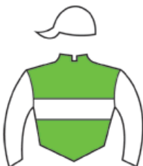
<< ISLA TORINA >>

Midshipman y Stormy Easy por Easing Along (Haras Don Alberto)