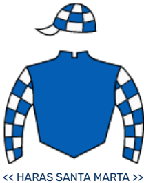
<< HARAS SANTA MARTA >>

4 GRAN CONSERVADOR 2 0 1 1 5 9 2 0 0 0 2 4 0 0 0 0 1 1 $4.560.000