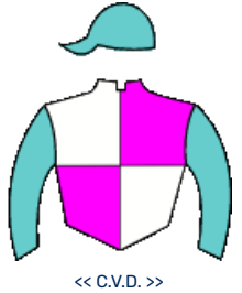
<< C.V.D. >>

BLESSED 2 0 0 0 9 11 2 0 0 0 9 11 0 0 0 0 1 1 $4.940.000