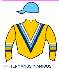
<< HERMANOS Y AMIGOS >>

Longboarder y La Gourmet por Merchant Of Venice (Haras Don Luis)