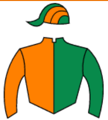
<< BENNETTIG >>

Forever Thing y Increasing por Honour And Glory (Haras Puerta De Hierro)