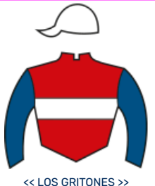
<< LOS GRITONES >>

Midshipman y Triple Joy por Stuka II (Haras Don Alberto)