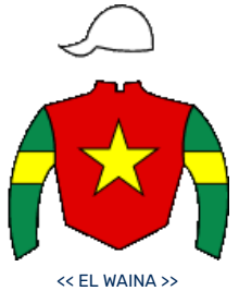
<< EL WAINA >>

WISE CHOICE 4 5 2 6 38 55 0 0 0 0 2 2 1 2 0 0 6 9 $12.460.000