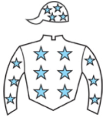
<< LOS AVIADORES >>