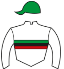
<< MAYNICO >>

BUEN PENSAMIENTO 1 0 3 0 7 11 1 0 3 0 7 11 0 0 0 0 3 3 $3.497.500