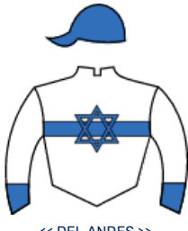
<< DEL ANDES >>