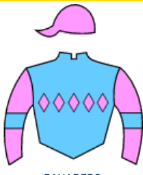
<< PANADERO >>