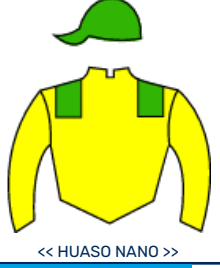
<< HUASO NANO >>

Y A QUIEN NO 2 6 6 4 39 57 1 5 5 2 29 42 0 0 1 0 5 6 $8.068.000