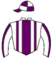
<< NAYET >>

Viscount Nelson y Veronesa por Dylan Thomas ( Haras Don Alberto )