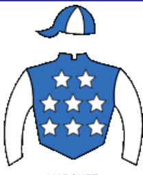
<< MARQUEZ >>