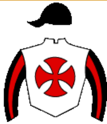
<< LCG >>

Morning Raider y Roman Forum por Dunkirk (Haras Sumaya)