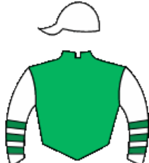
<< AMOR PROPIO >>

Van Nistelrooy y Eleonor por Newfoundland (Haras Dadinco)