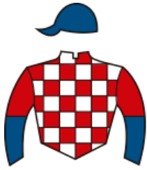
<< STUD MAURO >>

EXaggerator y Tuscan Moon por Mizzen Mast (Haras Dona Icha)