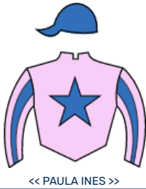
<< PAULA INES >>