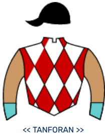
<< TANFORAN >>

2 NO BASTA 2 5 4 0 27 38 0 0 0 0 1 1 0 0 0 0 2 2 $2.152.000