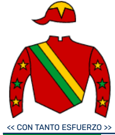
<< CON TANTO ESFUERZO >>

Competitive Edge y Cazafortunas por Soldier Of Fortune (Haras Convento Viejo)