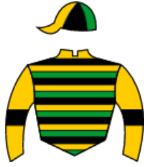
<< EL AVENTURERO >>

TENORES 3 1 2 3 23 32 3 1 2 2 22 30 0 0 0 0 7 7 $8.298.250