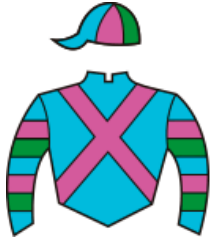
<< VIDA NUEVA >>

PAPITO ALFREDO 1 0 0 1 12 14 1 0 0 1 12 14 1 0 0 0 1 2 $7.892.500