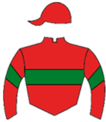
<< HARAS SUMAYA >>