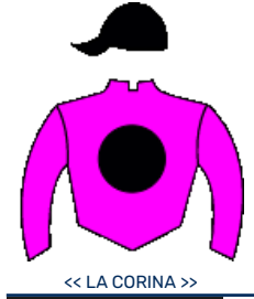
<< LA CORINA >>

Viscount Nelson y La Rockola por Rock Of Gibraltar (Haras Don Alberto)