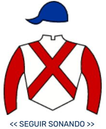
<< SEGUIR SONANDO >>

Tumblebrutus y Rie Mema por Holiday Spirit (Haras Mocito Guapo)