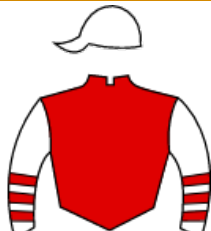
<< LEON POBLETE >>

Remote y Telemaniaca por Hennessy (Haras Argentina)